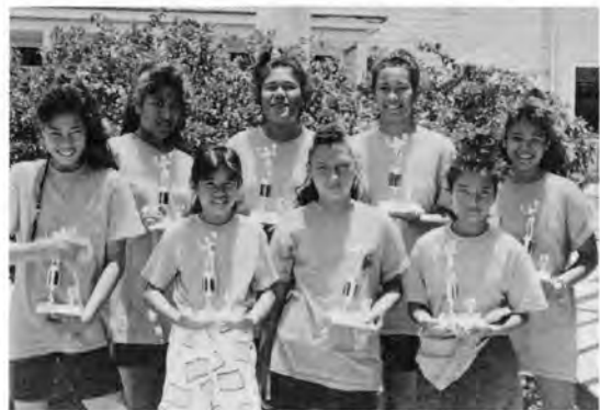
Pakolea Volleyball Team displaying their trophies