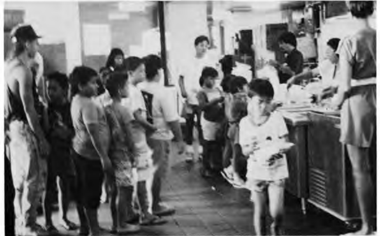
Children in our Summer Fun Program being served their lunches. The lunch is part of the program.

The FEEDING CENTER PROGRAM provides meals for children who participate in our designed programs. These include the Pakolea Programs, Summer Fun and Enrichment Program and the In-Community Treatment Program. This program depends on a cook and a host of volunteers. Last year, there were over 16,000 meals served.