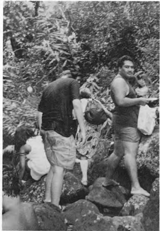
Part of the Summer Fun Group on a hiking trip in the Palama Uka Camp Mountains.