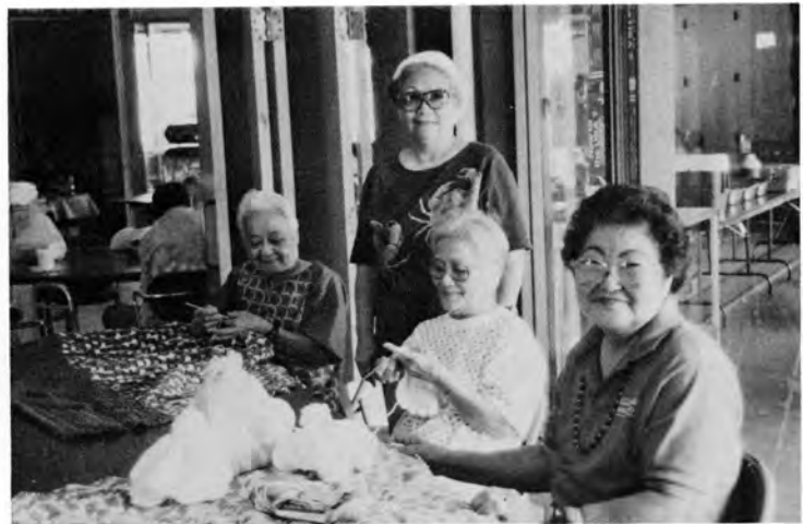
Seniors enjoying a relaxing day crocheting.

Many small and large stores such as Times Market, Foodland, Longs Drug Stores donated prizes for these events.