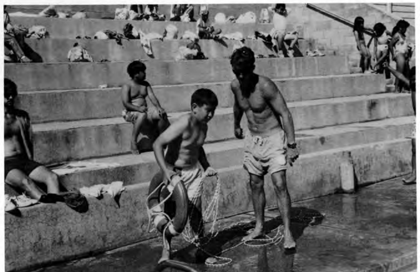
Students from one of the elementary schools in the neighborhood listening to their instructor while another gets a tip on how to throw the life-line.