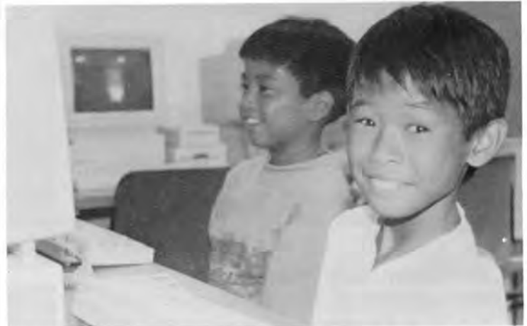
Students utilizing computers in the Computer Room of the LEARNING CENTER.

One instructional program that falls under the aquatic program is the swimming and life-saving program designed for the various elementary schools in the community. Students learn, under the guidance of a certified instructor and assistants, various swimming strokes as well as basic emergency life-saving techniques.