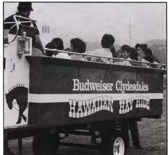
(To the right) Kids lined-up "a mile long" for a chance to ride the Budweiser Clydesdales Hawaiian Hayride. In fact, many of them came back a second and third time.