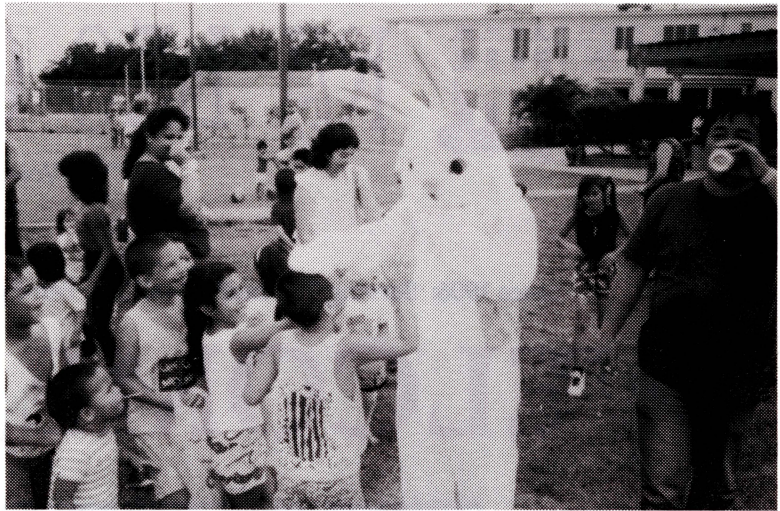
"Meet Mr. Bunny."

Preceding the Egg Hunt was entertainment provided by the University of Hawaii Rainbow Dancers. The children gathered