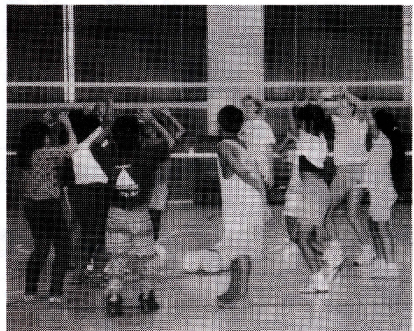
U.H. Wahine volleyball team instructing students at Palama gym.

We would like to extend a very warm mahalo to the U.H. Wahines for giving their time to help teach the youth of the Kalihi-Palama area.