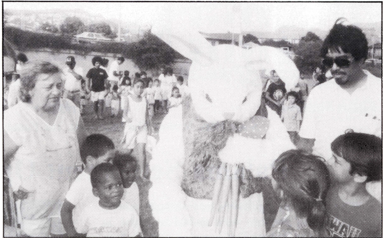
Mr. Bunny and friends enjoy food and entertainment at Palama Settlement's Community Easter Event.

The Hyatt Regency Hotel generously donated staff and food for the occasion. They set up barbeques and cooked and served hot dogs, hamburgers and soda to