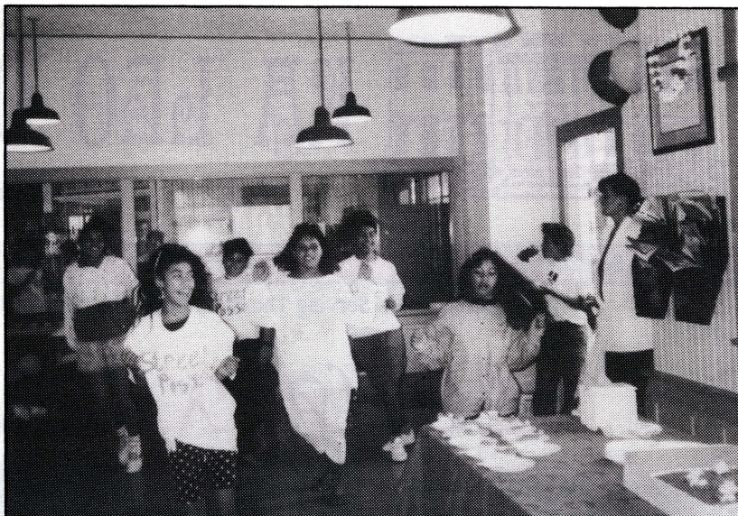
Members of the Street Posse dance group performing during the annual celebration of the Leland Blackfield Center.

The Macintosh IICX computer has been in almost constant use. A holiday and sports clip-art file was developed to be used for the flyers and booklets handed out by the different programs. We have also used the Mac to make new forms and redo existing forms used by the programs. The Macintosh has been very useful in developing a number of different types of material.