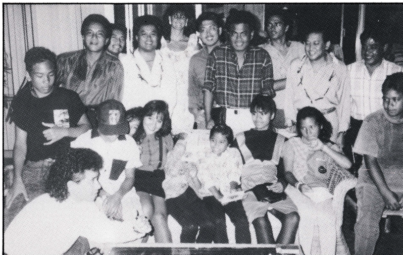
Palama Settlement youth and staff meet with members of Society of Seven after their show in Waikiki.

The Society of Seven Performing Arts Group "Street Posse" has started practice and will be performing at the Christmas event on December 14, 1990 at Palama Settlement. "Street Posse" is a dancing and singing group that will be performing at different functions. The SOS band and their staff are the ones who made this all possible due to the funding they provided for the program. The group consists of teens who are between 11 and 15 years of age.