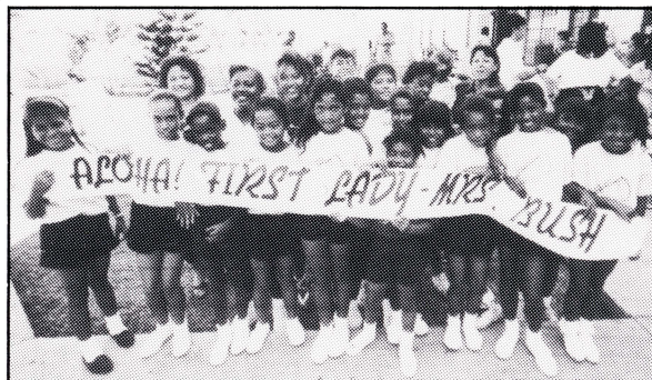
Pakolea Cheerleaders "strut their stuff" for First Lady Barbara Bush.