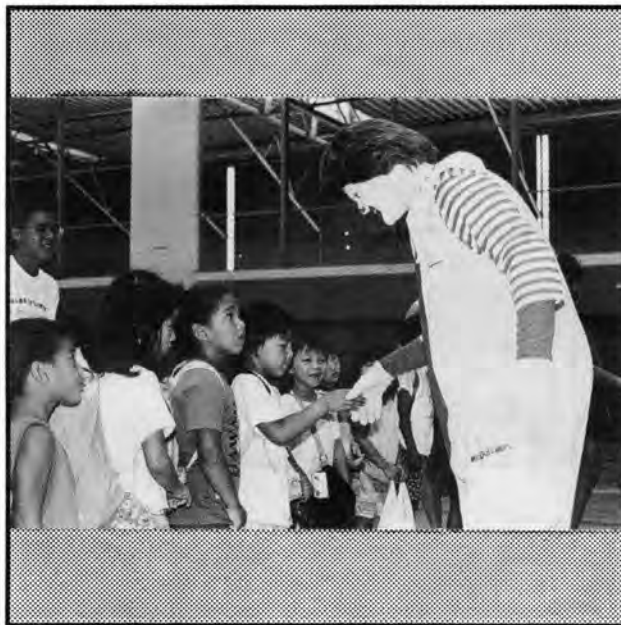
The children's favorite friend paid a visit. It was one of the shows put on by Ronald McDonald and enjoyed by young and old.