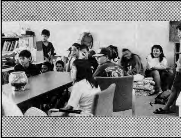
The Teen in their first meeting with their leaders.

The Summer Safari is in full swing...program included many projects, excursions and educational experiences. One fun team building experience was the "Boat Race." The youngsters had to plan together as a team, construct the boat as a team and race the boat as a team.