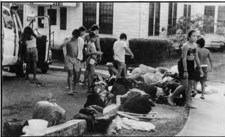
Back from camp--all wet, dirty and tired.