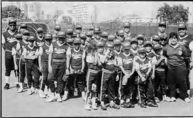
The Palama Settlement's Baseball Teams (Pinto, Mustang & Bronco) and their coaches on Opening Day at Rainbow Stadium.

Palama opened its baseball season in April, 1993, with the Police Activity League Opening Ceremonies at Rainbow Stadium.