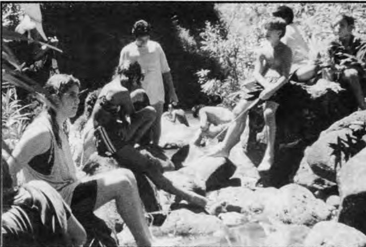
Cooling their feet near "Baby Pond" while on hike at Camp Palama Uka.