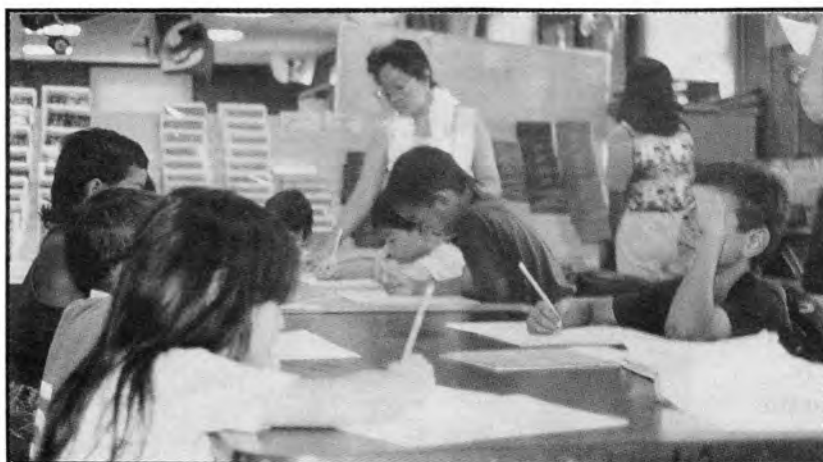
The children taking an exam that will be used to place them in the appropriate reading program.