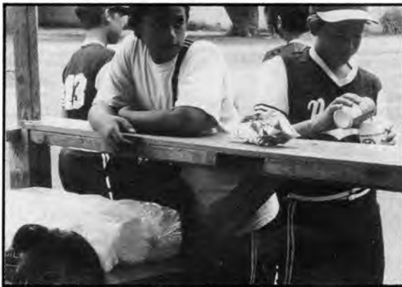
Members from Palama's Bronco Baseball team getting a snack at the concession booth before their game.