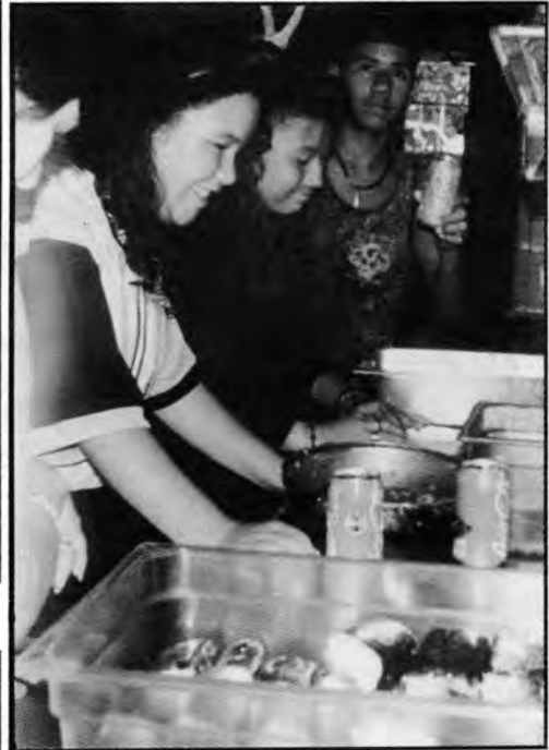
Teens preparing snacks for their group to take to Farm Fair.