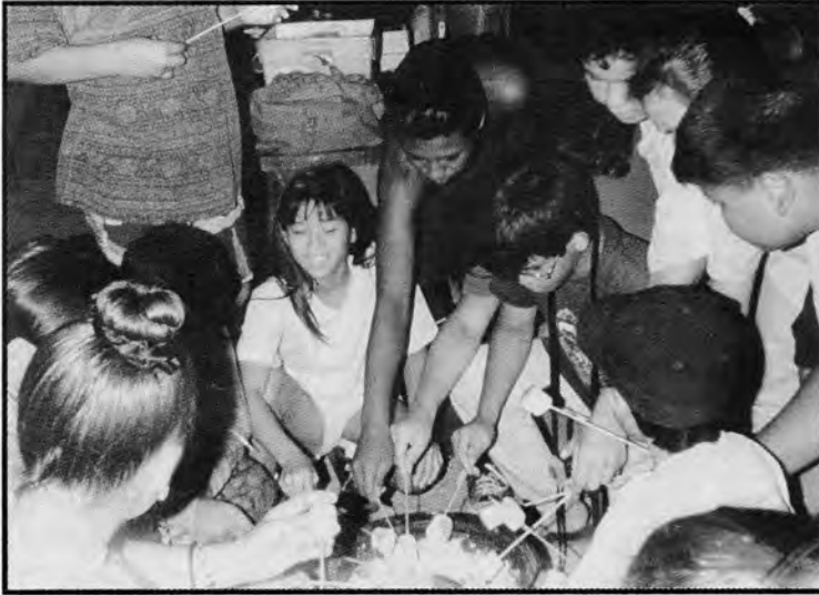
Marshmallow roast in the evening at Camp Palama Uka.